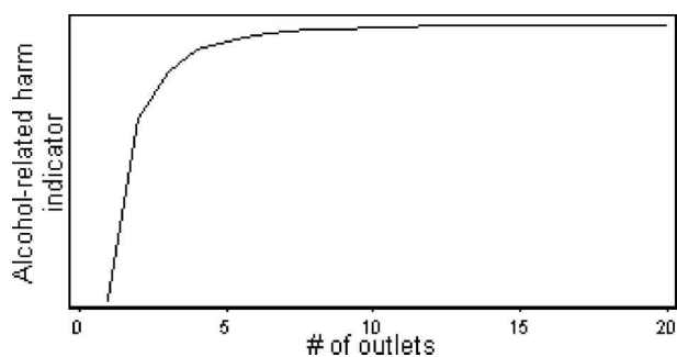
Figure 1. Model of proximity effect of outlets based on the square of the average distance to the nearest outlet in a hypothetical community measuring 5 \times 5 km.

Broadly speaking, studies examining levels of consumption should be looking for a proximity effect of